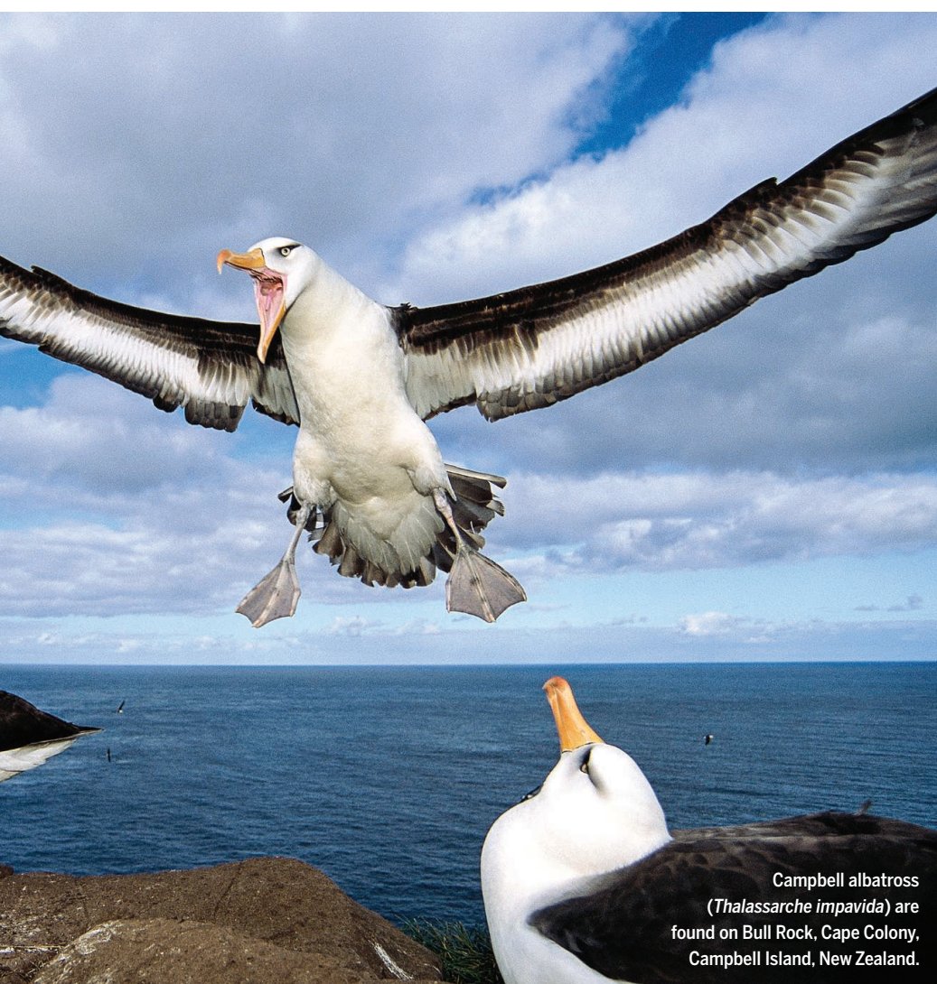
Campbell albatross ( Thalassarche impavida ) are found on Bull Rock, Cape Colony, Campbell Island, New Zealand.

on the high seas, will continue to protect biodiversity under climate change scenarios (4); others suggest that current MPAs will be ineffective, particularly in tropical and temperate regions (11), reflecting substantial uncertainty around the nuances of how species are responding to climate change. As species and habitats shift across space and time, mMPAs could be used to protect dynamic oceanographic habitats critical for ecosystem function, such as fronts, currents, or eddies, or to protect individual species or groups of species. mMPAs can further serve to protect connectivity corridors between static MPAs and thereby help to “future-proof” such MPAs against shifts due to climate change by offering protection when key species or habitats shift outside static boundaries. Dynamic habitats have already been described on the high seas through the Convention on Biological Diversity’s (CBD) Ecologically and Biologically Significant Area process (12) (see the figure and the supplementary table). Initiatives such as the Migratory Connectivity Project (MiCO) of marine species can be built upon to track the movement of species across their ranges and jurisdictional boundaries (13). Like traditional MPAs, mMPAs could be managed to protect species and habitats from mul-